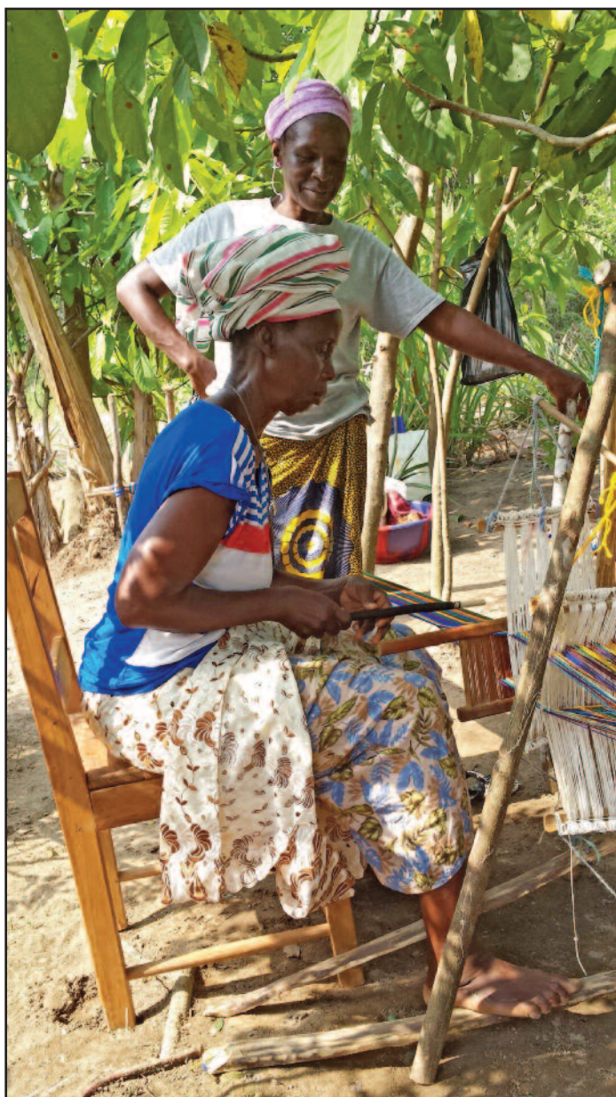
Members of the Women’s Weaving Cooperative

RESTORE HOPE: LIBERIA is currently investing in its first economic development pilot project. The Women’s Weaving Cooperative was established by our beneficiaries’ caregivers themselves. With RESTORE HOPE: LIBERIA’s support, the Women’s Weaving Cooperative generates income from the members’ traditional, artisanal weaving.