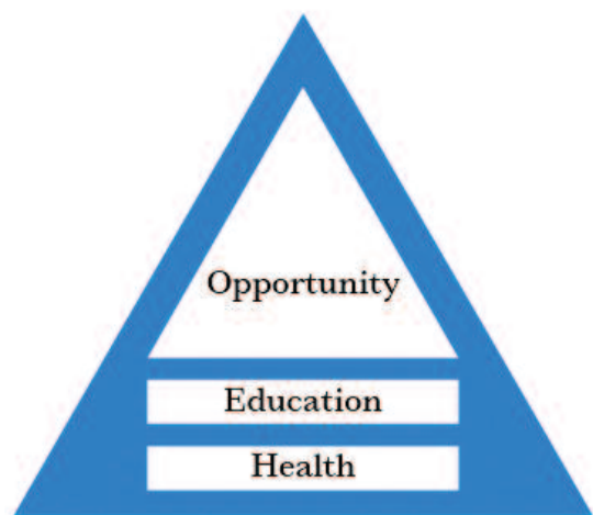
PYRAMID OF HOPE

Our model is driven by community needs, building leadership and strengthening civic society as we empower the most vulnerable. It is based on a three-tiered Pyramid of Hope— Health, Education, and economic Opportunity —providing the individuals we serve with coordinated support. While meeting the community’s most pressing needs, we are also investing in its future.